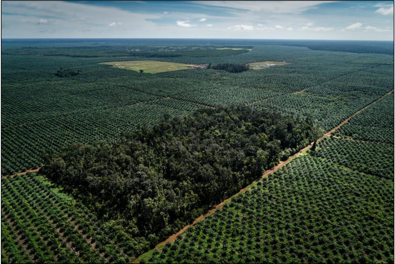
Fig. 3. West Kalimantan Palm Oil Plantation Expansion 18

they can also afford to renovate their houses. Some farmers even manage to buy trucks to start a transportation business. Farmers do recognize the destructive impact that the plantation development has brought, but they choose to focus more on the economic gain.