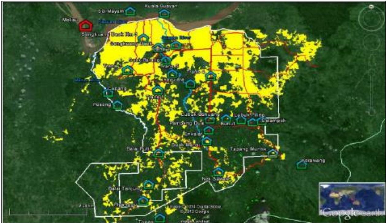
Fig. 2. Palm Oil Fields Distribution in Buayan River Area 11

However, after nine years of total state-controlled operation, palm oil production in West Kalimantan began to shift to a private sector-oriented operation. In its 1989 report, the World Bank noted that the management capacity of Indonesian state-owned companies was low due to slow financialization to the companies (The World Bank 1989). The World Bank urged the Indonesian government to encourage the establishment of more private companies and let them eventually lead the national palm oil production. The Indonesian government took the report seriously and decided to follow the World Bank's suggestion.