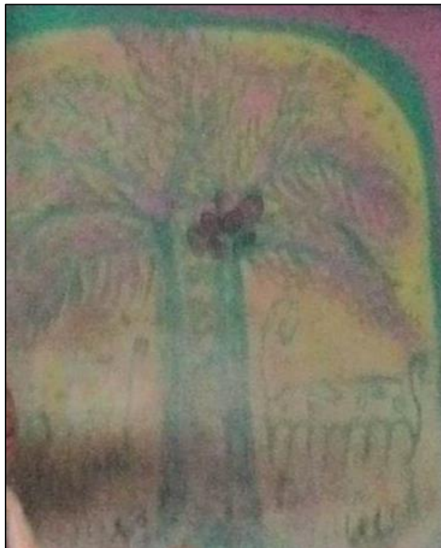
Fig. 4. Painting of the Eight-legged Black Dog Phantoms Surrounding a Palm Oil Tree in One Farmer's House.

Koci: “ Anjing hitam itu kuasa setan yang sering ganggu ana' Tuhan. Kita doa untu' usir setan itu! ” (That black dog is the devil who frequently haunts us, children of God. Let us pray to drive out that devil!)