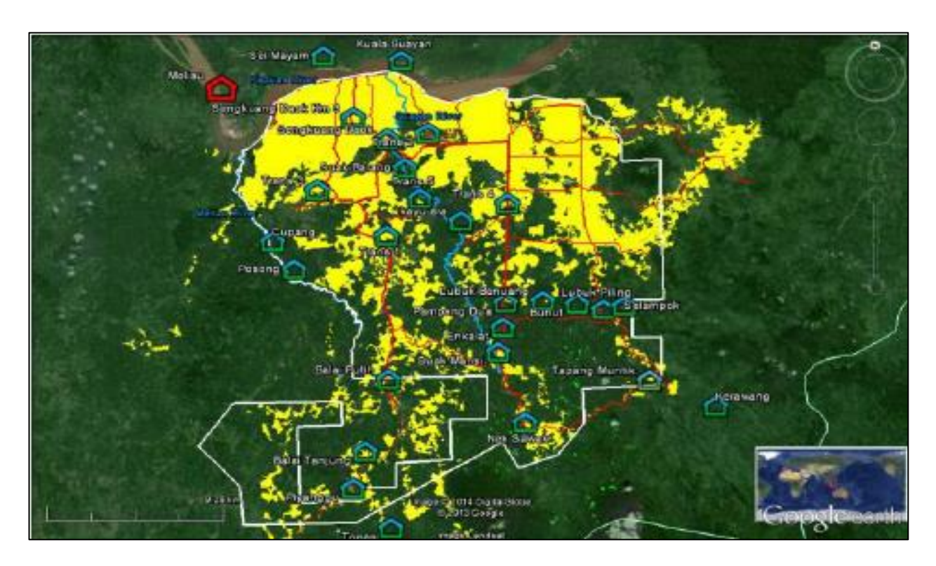
Fig. 2. Palm Oil Fields Distribution in Buayan River Area<sup>11</sup>

However, after nine years of total state-controlled operation, palm oil production in West Kalimantan began to shift to a private sector-oriented operation. In its 1989 report, the World Bank noted that the management capacity of Indonesian state-owned companies was low due to slow financialization to the companies (The World Bank 1989). The World Bank urged the Indonesian government to encourage the establishment of more private companies and let them eventually lead the national palm oil production. The Indonesian government took the report seriously and decided to follow the World Bank's suggestion.