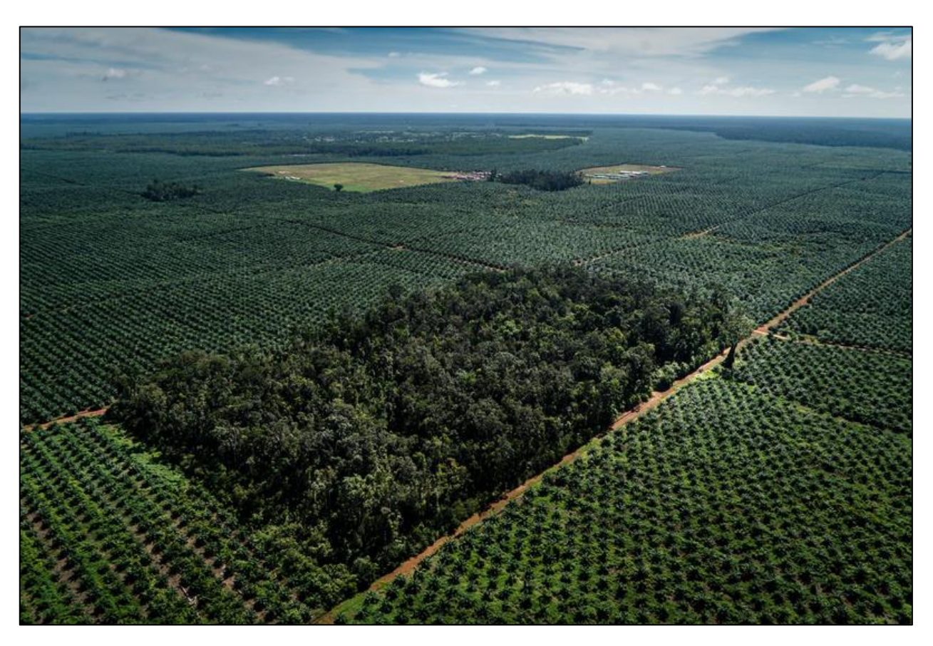
Fig. 3. West Kalimantan Palm Oil Plantation Expansion<sup>18</sup>

they can also afford to renovate their houses. Some farmers even manage to buy trucks to start a transportation business. Farmers do recognize the destructive impact that the plantation development has brought, but they choose to focus more on the economic gain.