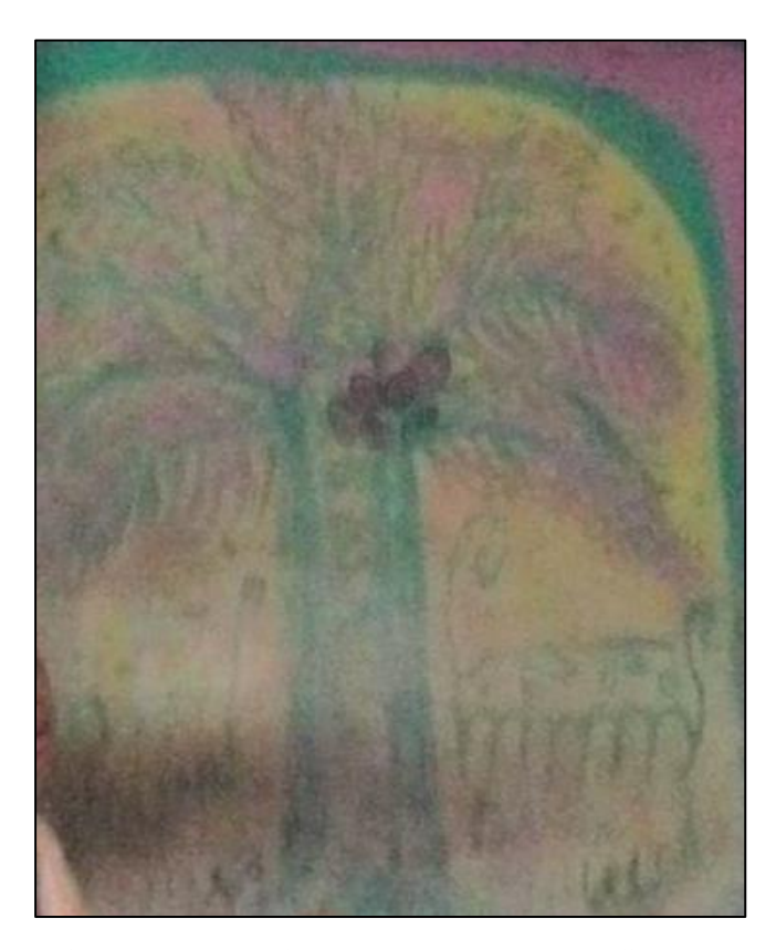
Fig. 4. Painting of the Eight-legged Black Dog Phantoms Surrounding a Palm Oil Tree in One Farmer's House.

Koci: "Anjing hitam itu kuasa setan yang sering ganggu ana' Tuhan. Kita doa untu' usir setan itu!" (That black dog is the devil who frequently haunts us, children of God. Let us pray to drive out that devil!)